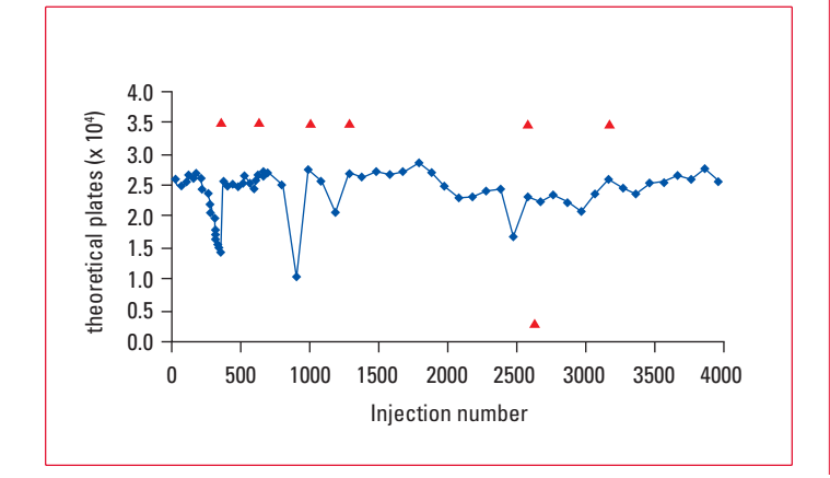
Figure 2. Variation of column efficiency with injection number. Column, guard column and other conditions as in Figure 1. Data points indicate sample injection to determine column efficiency and other parameters. Red triangles indicate guard column replacement due to either a drop in efficiency or an increase in pressure drop.